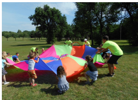
St. Mark's Bible Club