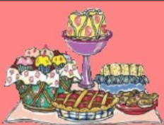
Sweets for the Sweet

THANKS to everyone that made Sweets for the Sweet another success. From bakers to buyers and everyone else who helped organize and make it happen we just say how much it was appreciated. $1050.00 was raised that will be used in ministry through the United Methodist Women.